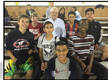
NAMS students from the Mustache Fraternity pose with Mayor David Smith.