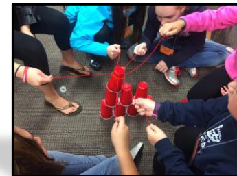
Students at NC Association of Student Councils Middle Level Workshop at SAMS.