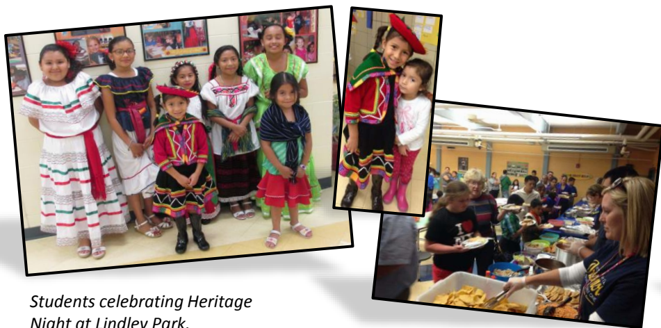
Students celebrating Heritage Night at Lindley Park.

Lindley Park held their Annual Title I Night on Thursday, October 1 st with over 250 participants. Literacy-themed activities as well as Hispanic Heritage projects were available for parents/guests to view in the classrooms. A smorgasbord of authentic foods was enjoyed by all in the school cafeteria.