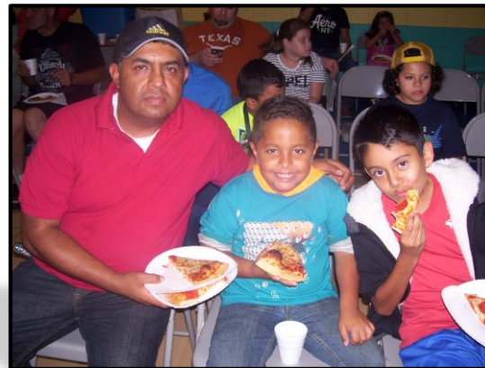
Families at the WATCH D.O.G.S. kick-off at Balfour.

On Tuesday, Sept 29 th , Balfour held the Watch D.O.G.S. (Dads of Great Students) kick-off. A total of 137 dads came to take part in this event! Watch D.O.G.S. is an innovative father involvement, educational initiative of the National Center for Fathering. Dads have begun to sign-up to spend the day at Balfour to be a positive male role model and give the students an extra sense of security.