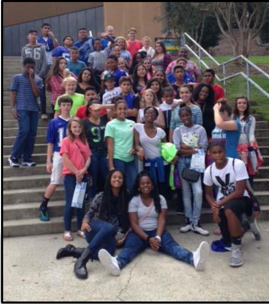
SAMS students in front of the Dean E. Smith Center.

On Wednesday, September 30, the 7th and 8th grade AVID classes from SAMS went to UNC-Chapel Hill. While there the SAMS students met with UNC students who led short informational sessions on various topics about getting into and staying in college. After the informational sessions, the students were taken on a campus tour and then enjoyed lunch in a campus dining hall.